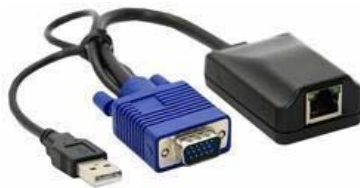
8 pieces USB KVM Dongle